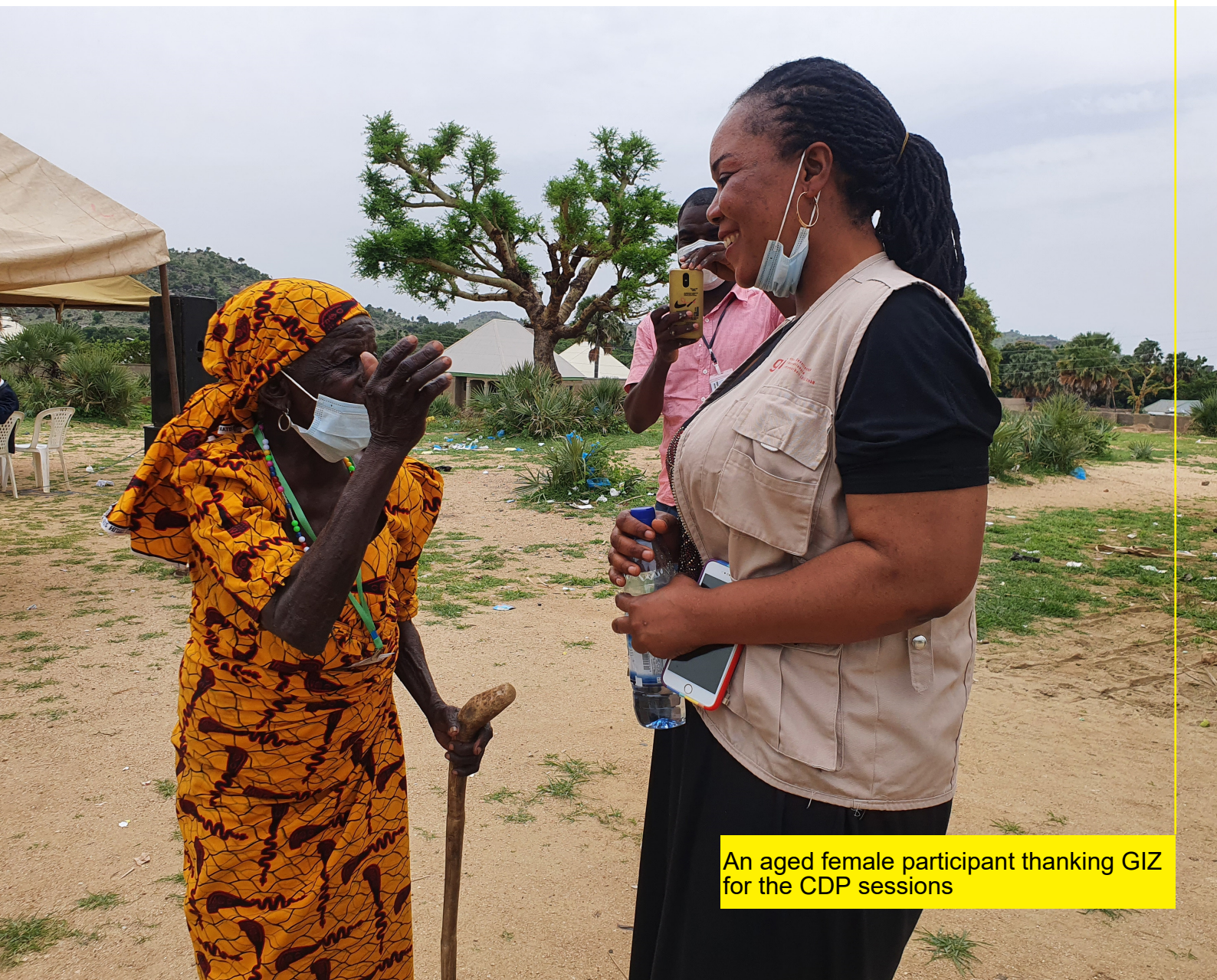
An aged female participant thanking GIZ for the CDP sessions