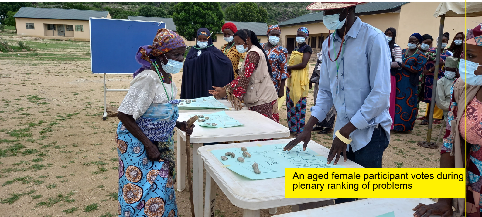
An aged female participant votes during plenary ranking of problems