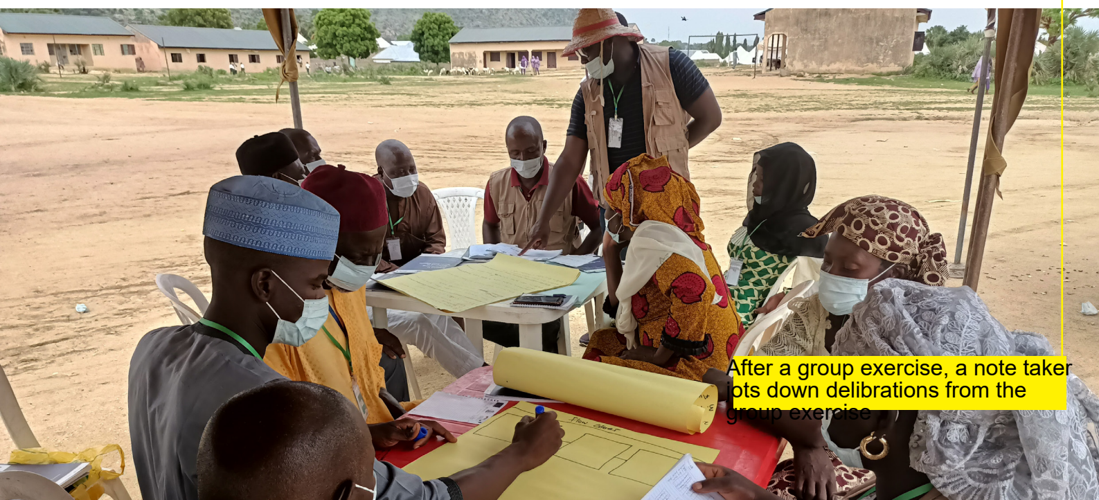
After a group exercise, a note taker puts down deliberations from the group exercise