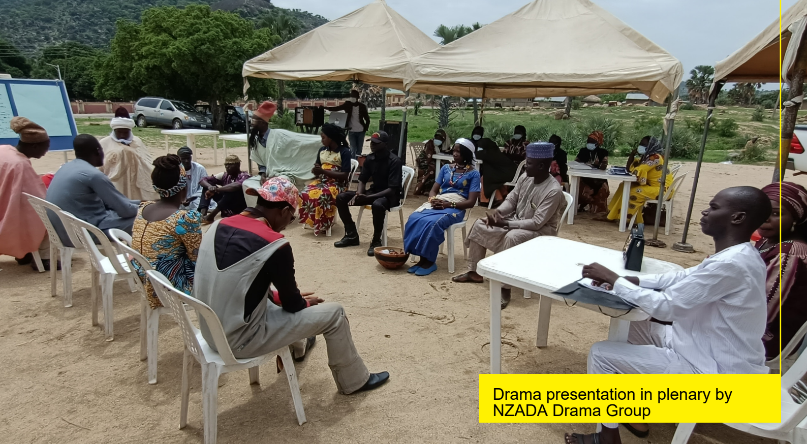
Drama presentation in plenary by NZADA Drama Group

This publication has been produced with the financial support of the European Union and the German Federal Ministry for Economic Cooperation and Development (BMZ). The contents of this publication are the sole responsibility of the GIZ and do not necessarily reflect the views of the European Union or the BMZ.