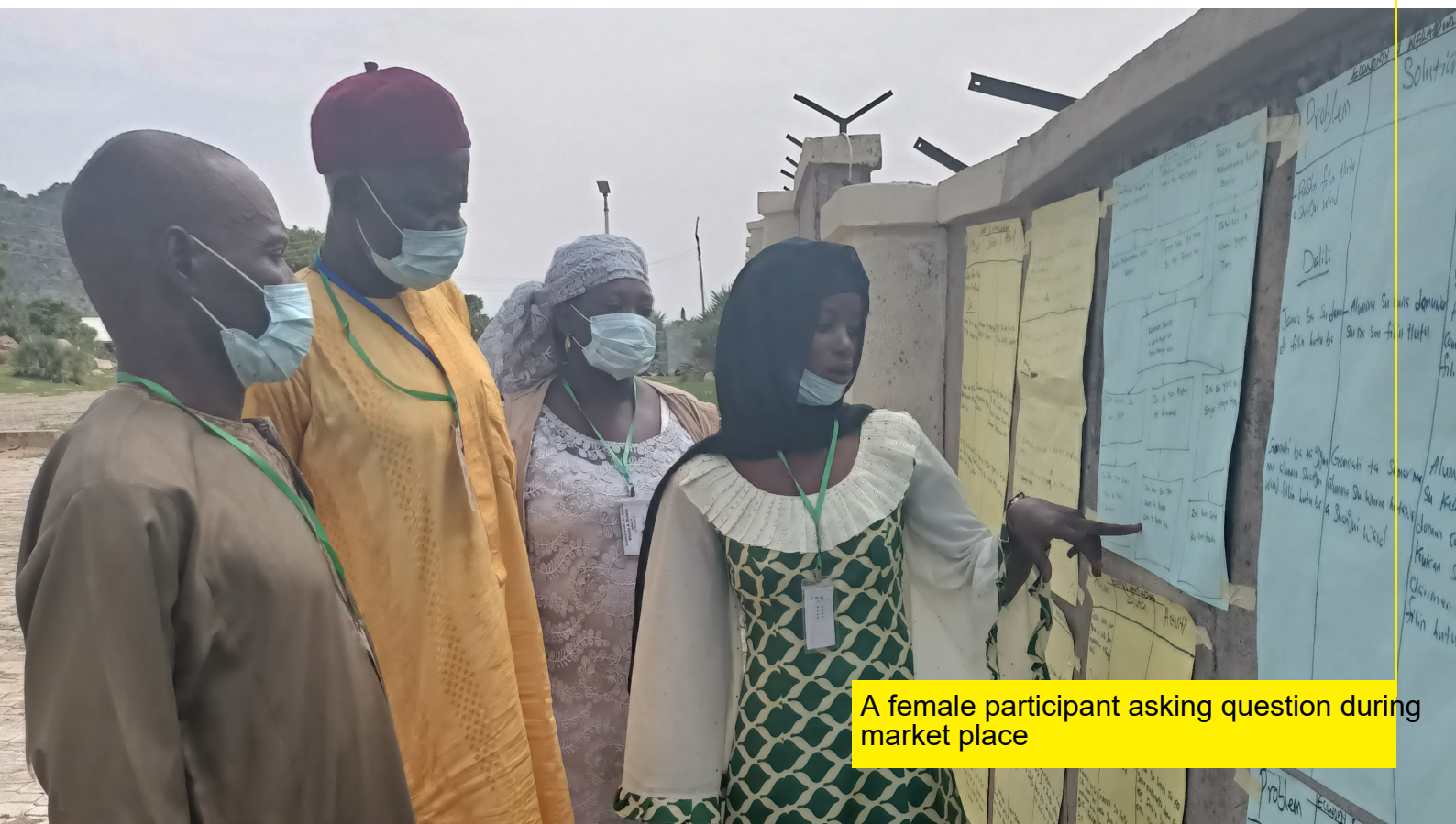
A female participant asking question during market place

lack of food storage facilities, insufficient teaching aids in our schools, insufficient drugs in clinics, lack of evacuation van, drug abuse and limited telecommunication network. These problems and challenges were clustered within seven sectors.