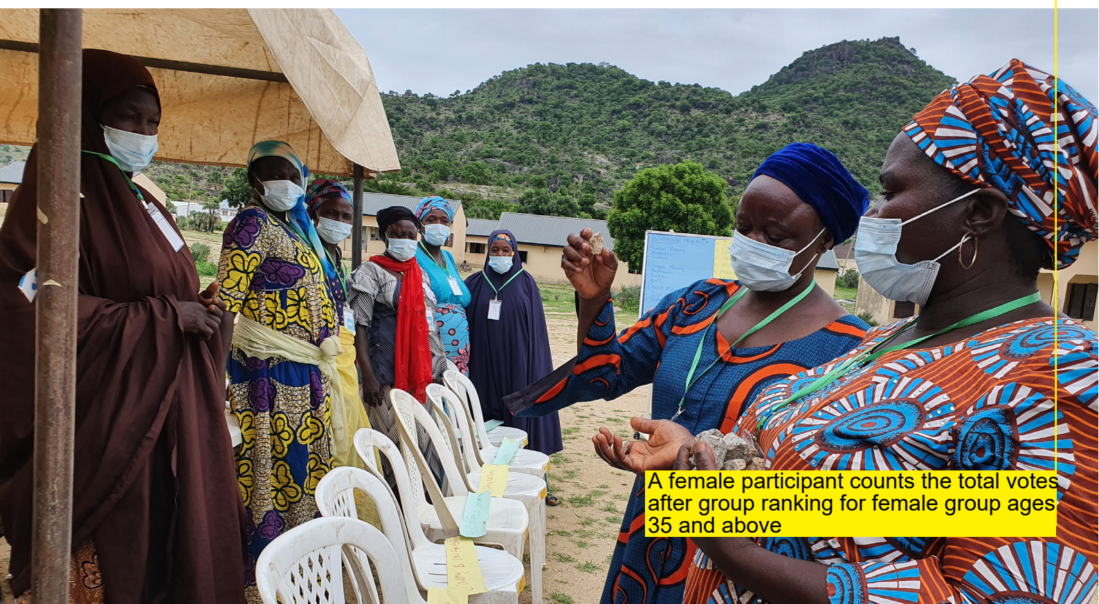
A female participant counts the total votes after group ranking for female group ages 35 and above