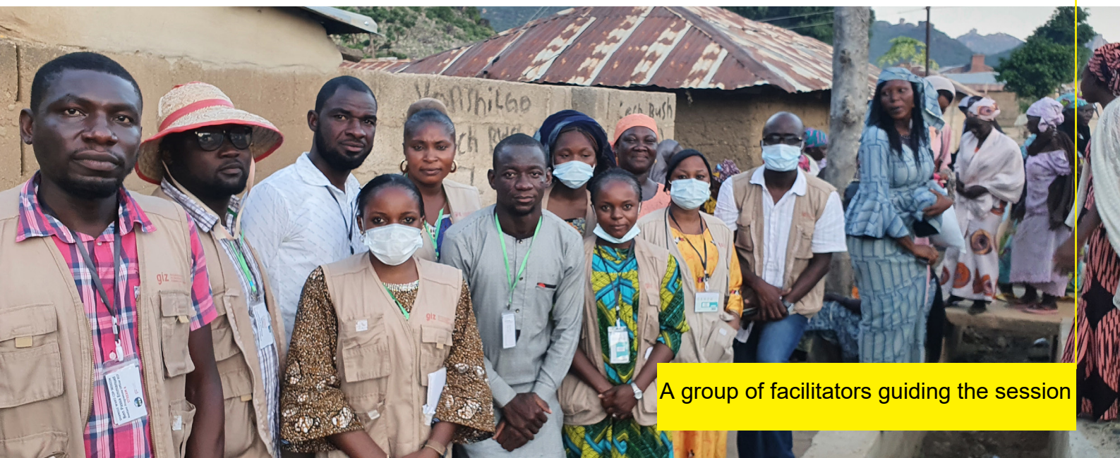
A group of facilitators guiding the session