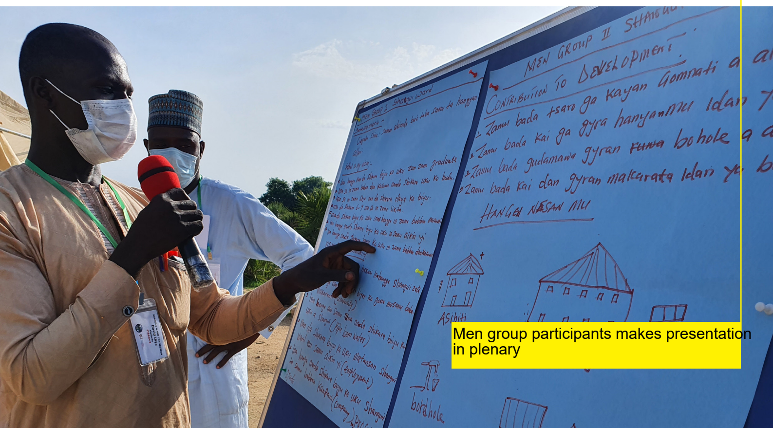
Men group participants makes presentation in plenary

During the CDP session, we identified our major development challenges as lack of police outpost,